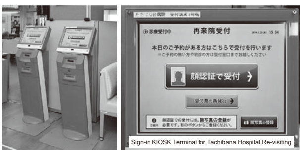
Photo 1 Outpatient revisiting system installed at the Tachibana-dai Hospital.

However, it is very time consuming to check visually every 400,000 photos that were collected from the debris of the quake-/tsunami-hit areas. In order to reduce such heavy burden, people's images are taken who visited project sites in order to look for photos that may record figures of their families and friends, and then NeoFace searches any photos including them in the 400,000 photo database. After employing Neoface, this project became to find targeted photos more effectively. Consequently, more visitors enabled to bring photos of their families, friends, etc. back home with recovered memories.