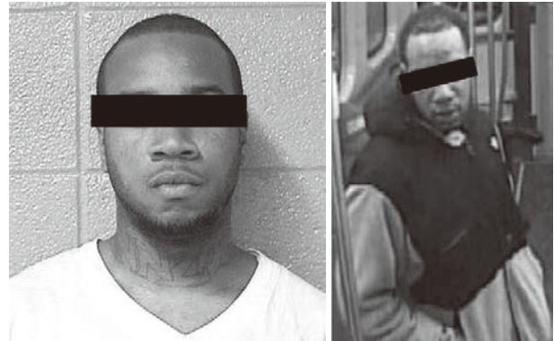
Photo 2 Registered face image of a burglar (left) and an image shot by a surveillance camera (right).

On 28th, January 2013, one of surveillance cameras of the Chicago Transit Authority captured a face image of a suspect who had robbed a cellphone with a gun and then ran off. The Chicago PD attempted to match this face image in their database, and the system output the person who was the actual