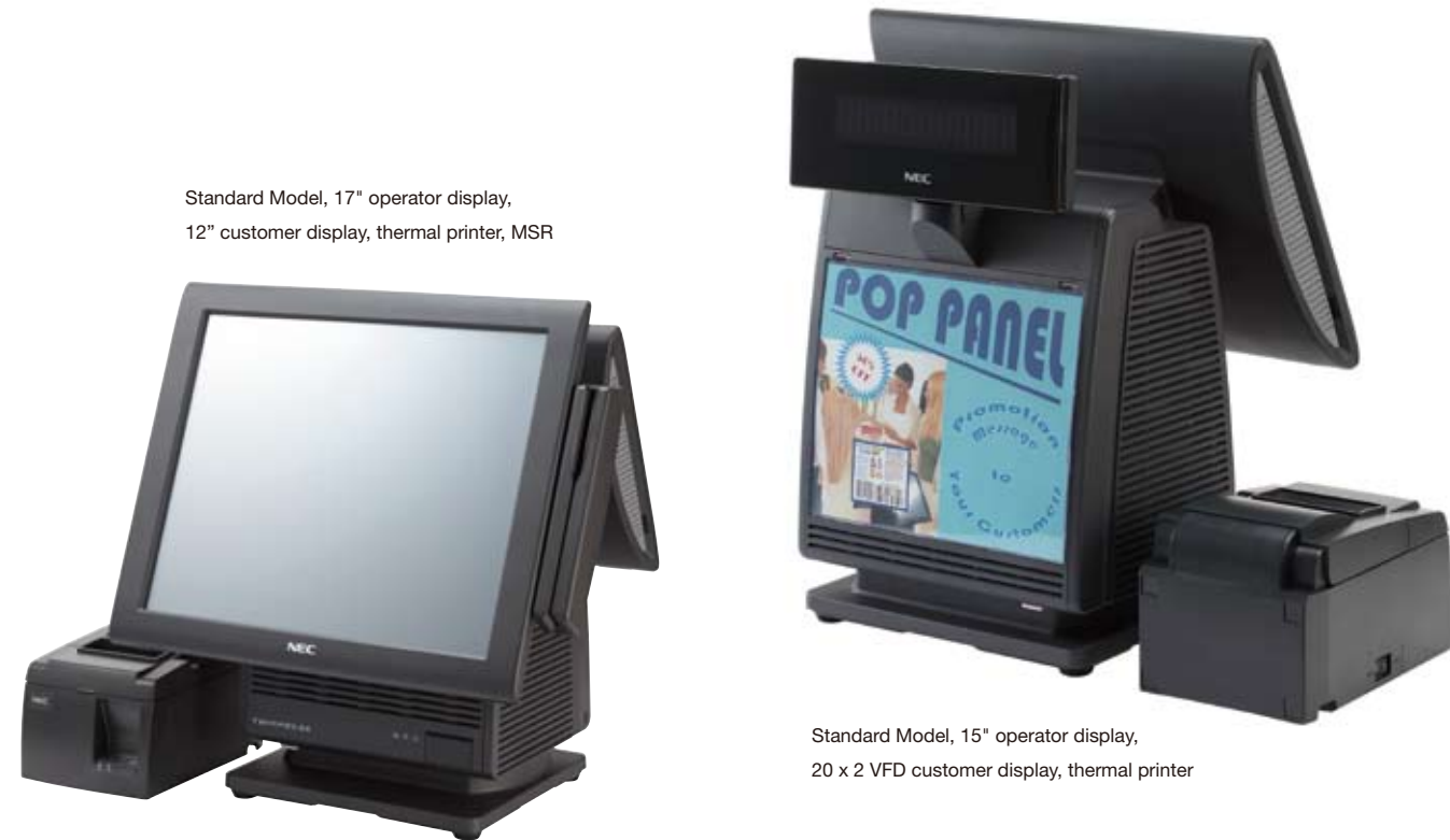
Standard Model, 17" operator display, 12" customer display, thermal printer, MSR