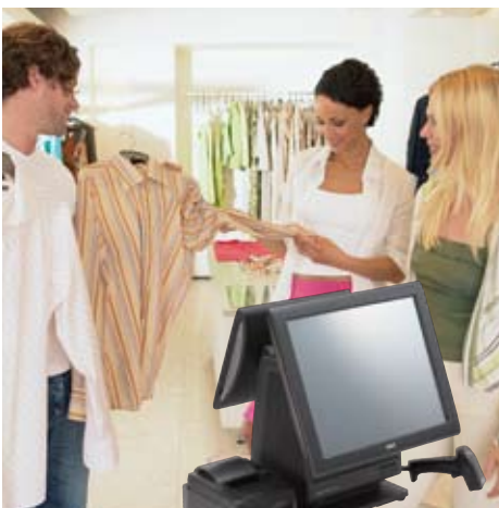
Standard Model 15" operator display, 12" customer display, thermal printer, handheld barcode scanner

TWINPOS G5 offers the smallest footprint of any dual LCD system. You can play promotion movies on the customer LCD to attract store guests as a digital signage solution.