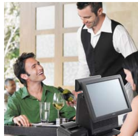
Fanless SSD Model 15" operator display, 20 x 2 VFD customer display, thermal printer

A fanless motherboard, compact footprint, SSD option and large touch screen perfectly meet the requirements of harsh store environments in the F&B industry.